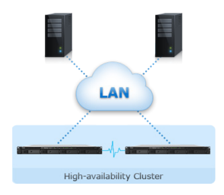
Figure 1) Reliability, Availability & Disaster Recovery

Synology High Availability ensures seamless transition between clustered servers in the event of server failure with minimal impact to businesses.