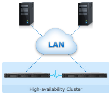
Figure 1) Reliability, Availability & Disaster Recovery

Synology High Availability ensures seamless transition between clustered servers in the event of server failure with minimal impact to businesses.