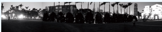
Night View (IR Off)