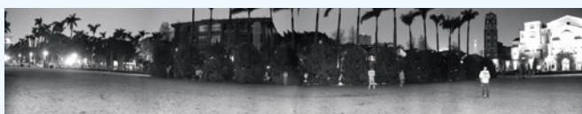
Night View (IR On)