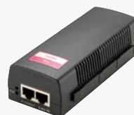
POI-2002 PoE Injector