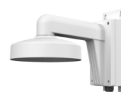
DS-1473ZJ-135B Wall Mount with Junction Box