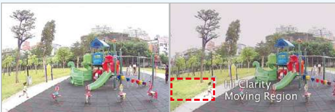
Without Smart Stream II